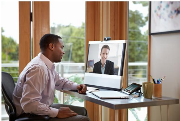
Figure 2. Cisco TelePresence EX90 in Remote Expert Scenario with Document Camera