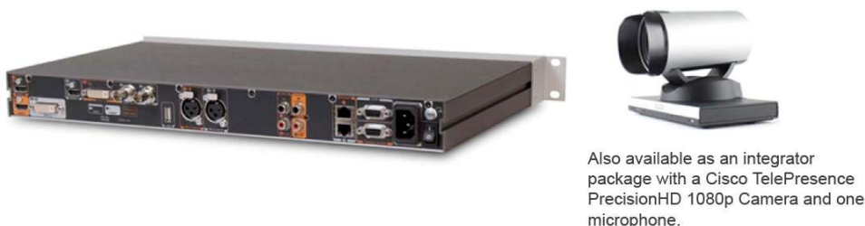
Figure 1. Cisco TelePresence Codec C40

The Cisco TelePresence® portfolio creates an immersive, in-person experience over the network—empowering you to collaborate with others like never before. Through a powerful combination of technologies and design that allows you and remote participants to feel as if you are all in the same room, the Cisco TelePresence portfolio has the potential to provide great productivity benefits and transform your business. Many organizations are already using it to manage costs, make decisions faster, improve customer intimacy, scale scarce resources, and speed products to market (Figure 1).